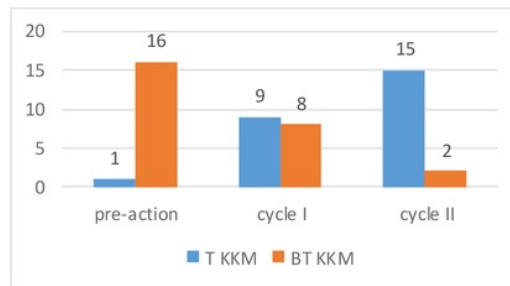
Fig. 2. Diagram of learning achievement pre-action, cycle I, and cycle II.

From the data above, it can be seen that students gain the score over the KKM are the amount of 15 students or 88,24% and students do not complete the minimum score are amount 2 students or 47,06%.